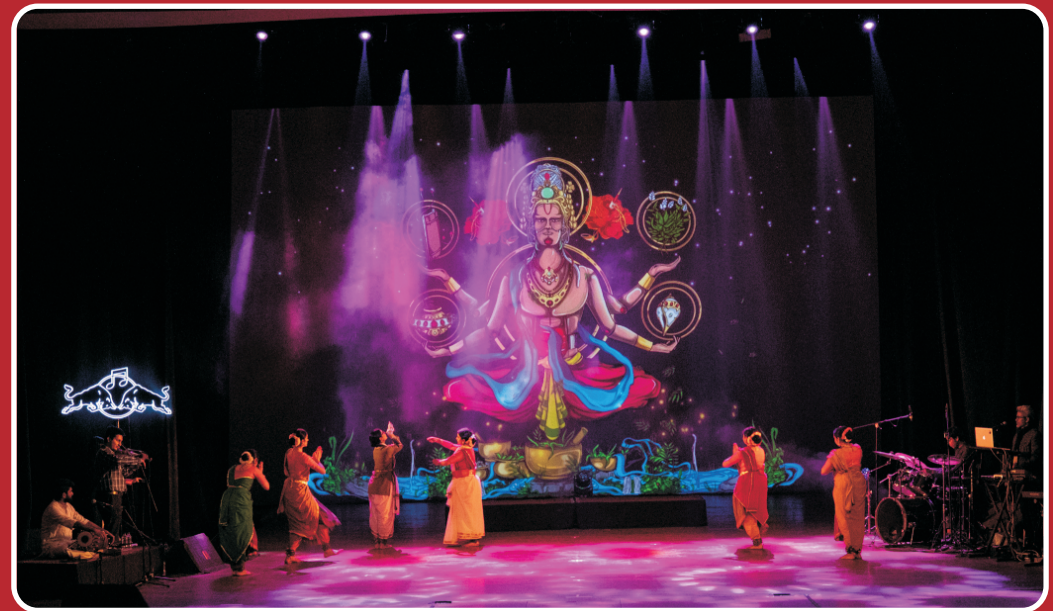
Bharatnatyam dance opera brings alive the quest of mathematical genius S.Ramanujan (Dec-2018, Delhi)