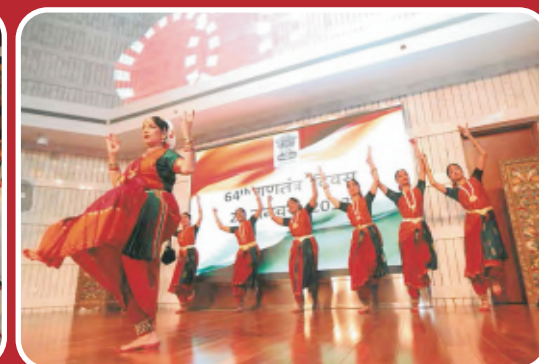
Beijing Performance 64th India's Republic Day Celebrations, ICCR Programme (2013)