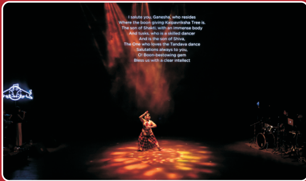
India's first Fantasy Bharatnatyam dance opera brings alive the quest of mathematical genius S.Ramanujan Fusing EDM, Carnatic music, video games and animation reflecting The Glimpses of South Indian Culture (Nov - 2018, Mumbai & Dec-2018, Delhi)