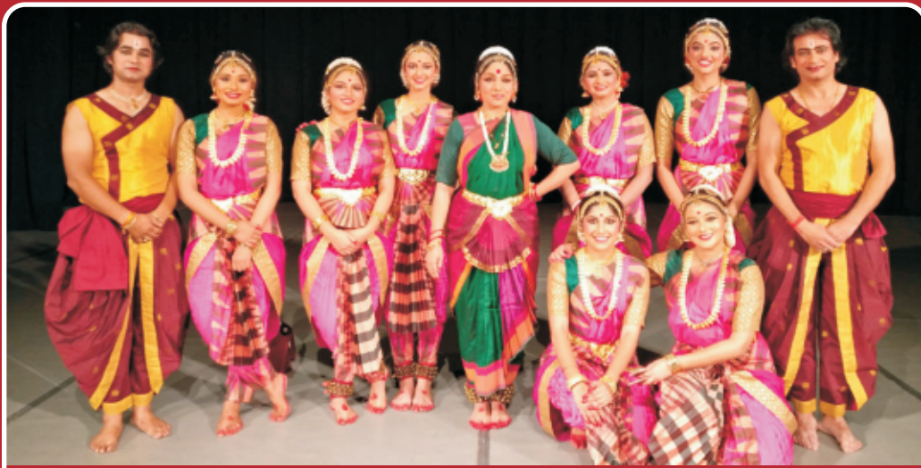
Festival of India 2018-19 Bharatnatyam Performance in Kaluga on 07 September