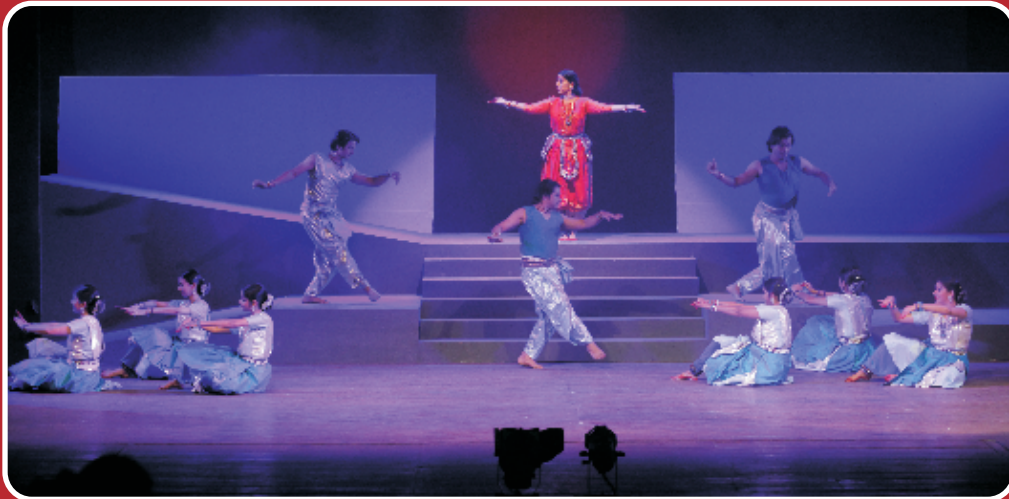
"Antariksha Sanchar" evolution of Flights and Aircraft, Chennai (Sep 2017), Bangaluru (Sep' 2016), Goa (Jan' 2015)

Faculty - Bharatanaytam and Music & Dance Co-ordinator at Triveni Kala Sangam, New Delhi