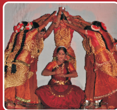
Kala Shruti Chennai (2017), ICCR Delhi (2013), Delhi Tamil Sangam (2012)