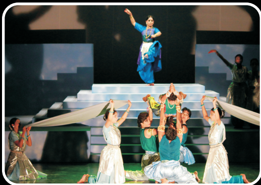
"Antariksha Sanchar" evolution of Flights and Aircraft, Delhi (2012)