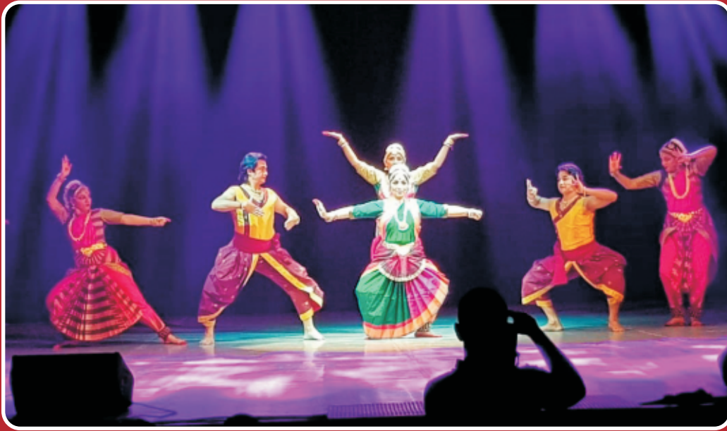
Festival of India, Kremlin Palace, Russia (Sep-2018)