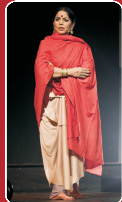
"Kannagi" MaxMueller Bhavan New Delhi (2012/15)