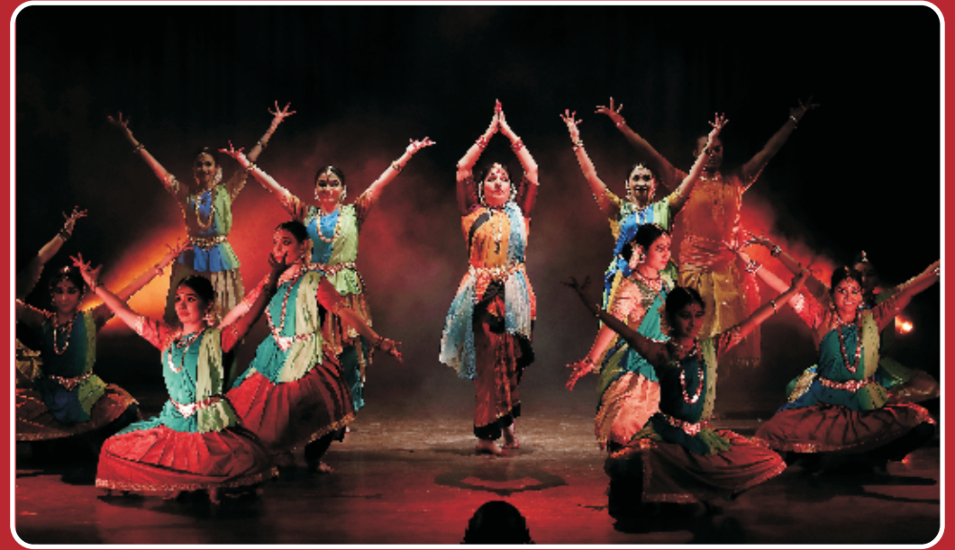
Akhandalaya, Delhi (Jan-2018)