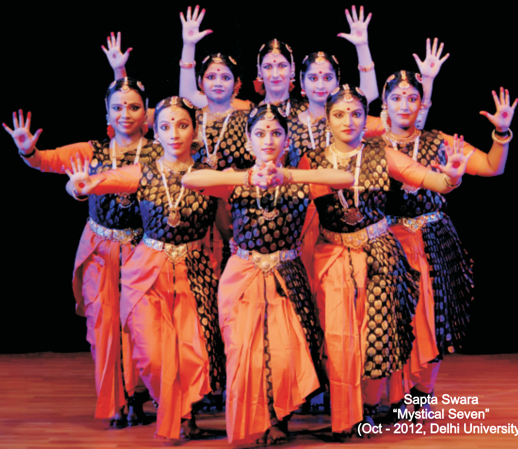
Sapta Swara "Mystical Seven" (Oct - 2012, Delhi University)