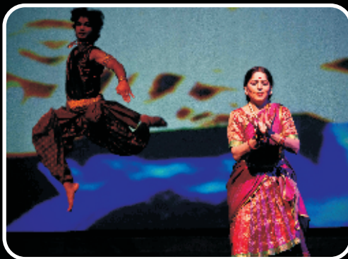
"Awakening", Delhi (2015), Bangaluru (2010)