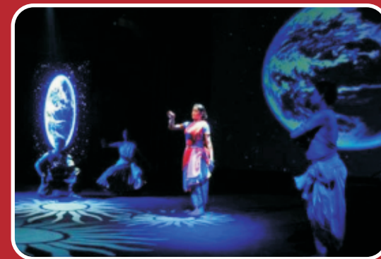
Light, NCPA, Mumbai (2015)