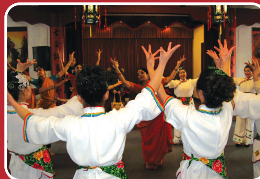
Shanghai - Jan 27, 2013 Workshop & interaction with the Chinese dancers at Changing District Art Centre (2013) by ICCR