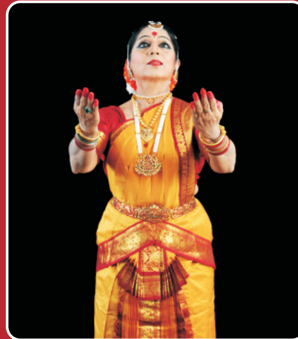
"Soorya Dance & Music Festival" Thiruvananthapuram (Oct' 2016)