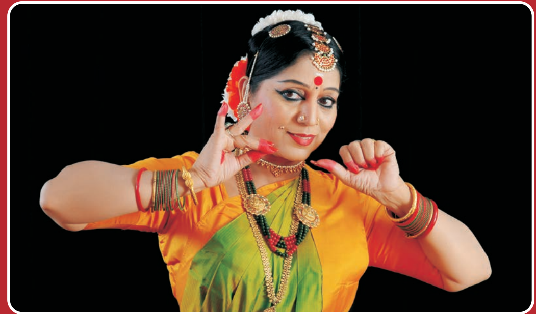
“Debadhara Festival” Delhi (Aug’ 2016)

Faculty - Bharatanaytam courses at Triveni Kala Sangam, New Delhi Founder Abhinayaa Centre for Dance, New Delhi