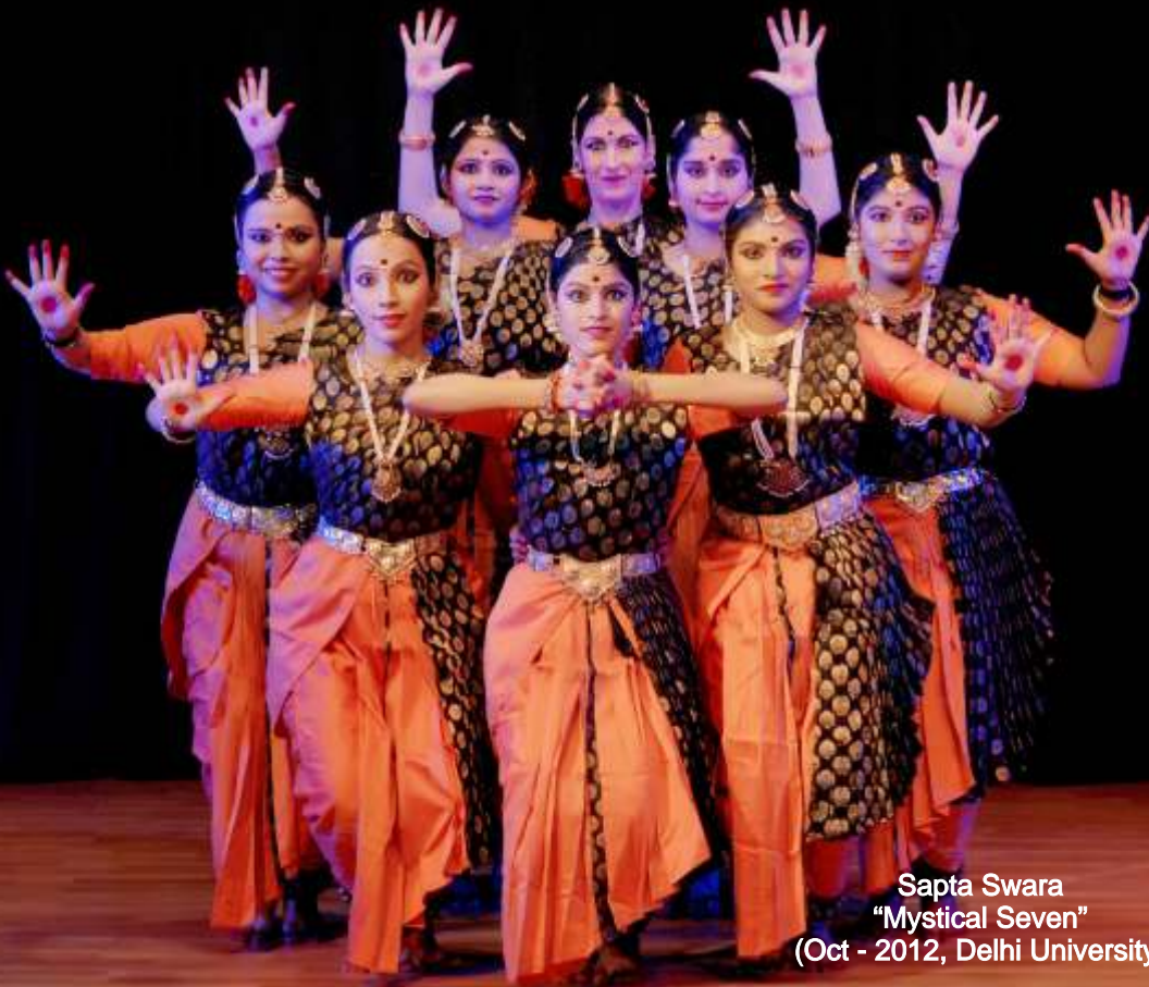
Sapta Swara "Mystical Seven" (Oct - 2012, Delhi University)