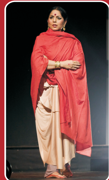
“Kannagi” MaxMueller Bhavan New Delhi (2012/15)