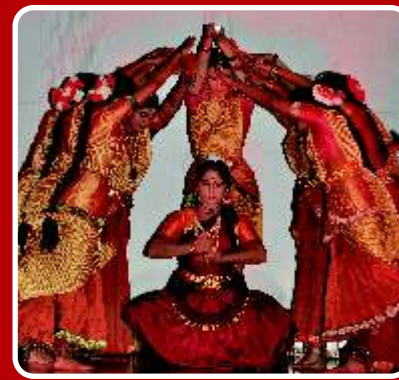
Delhi Tamil Sangam Kala Shruti (2012)