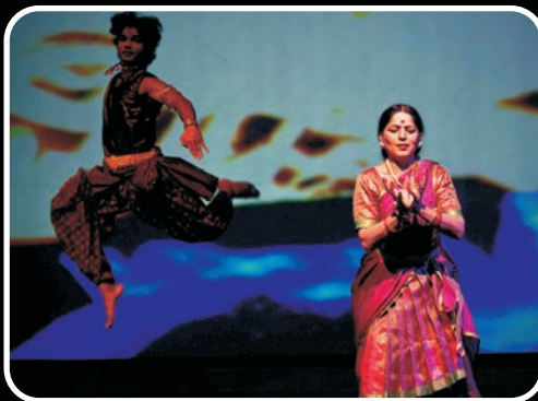
"Awakening", Delhi (2015), Bangaluru (2010)