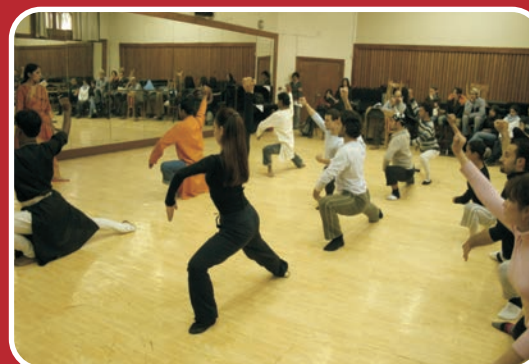
Interaction with the students Department of performing arts Demoscas - Syria (2007) by ICCR