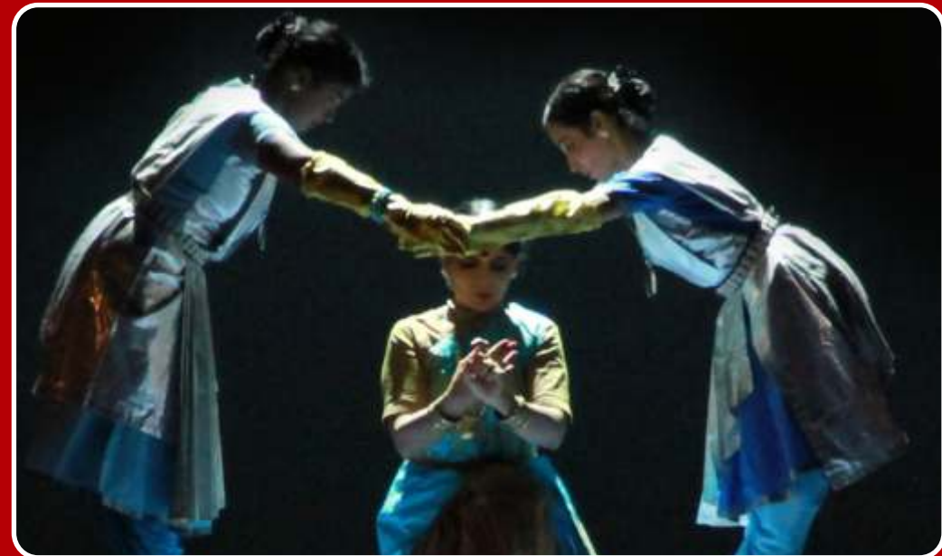
"Antariksha Sanchar" evolution of Flights and Aircraft, Bangaluru (Sep' 2016), Goa (Jan' 2015)