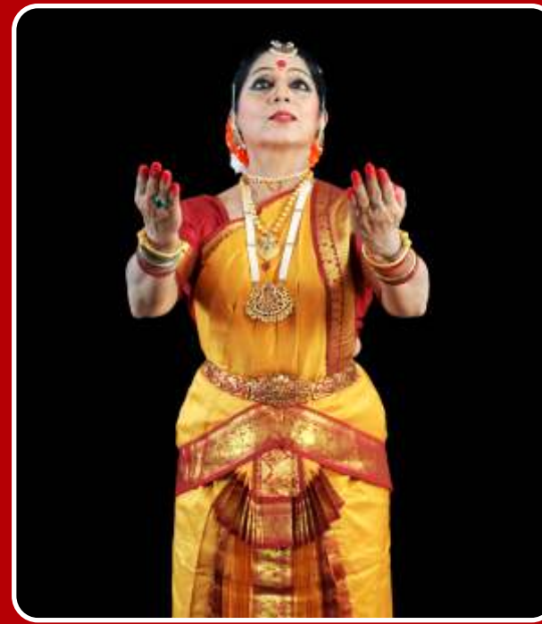
"Soorya Dance & Music Festival" Thiruvananthapuram (Oct' 2016)