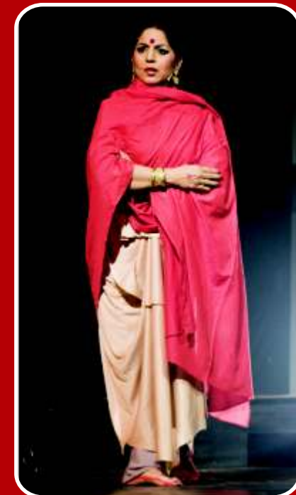
"Kannagi" MaxMueller Bhavan, New Delhi (2012)