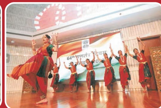
Beijing Performance 64th India's Republic Day Celebrations, ICCR Programme (2013)