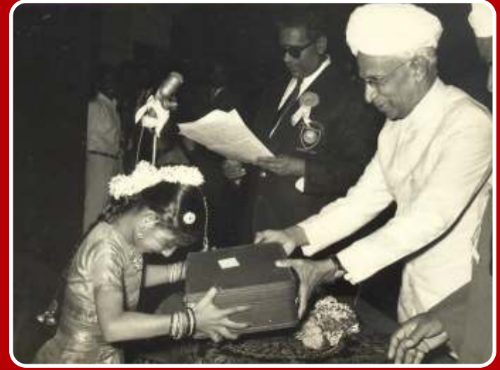
Receiving Prize inter Ministry Dance competition From President - Dr.Sri.Radhakrishnan