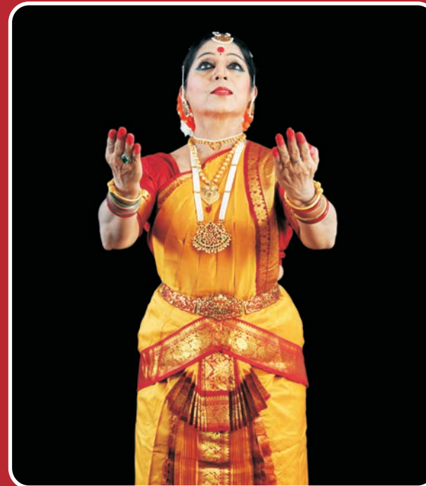
“Soorya Dance & Music Festival” Thiruvananthapuram (Oct’ 2016)