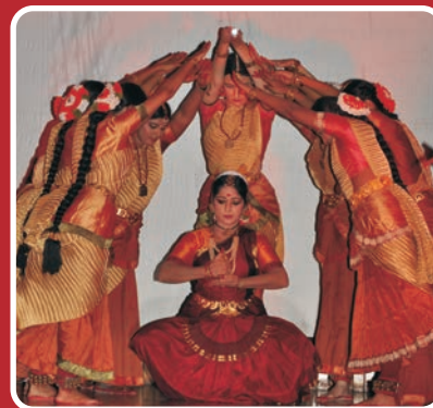
Kala Shruti Chennai (2017), ICCR Delhi (2013), Delhi Tamil Sangam (2012)