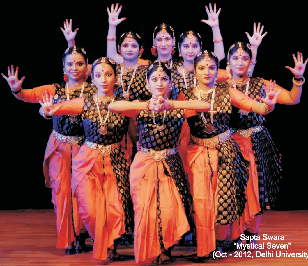
Sapta Swara "Mystical Seven" (Oct - 2012, Delhi University)