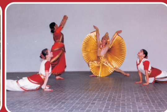
"Surya From Mystical 7" Delhi (2007), Chennai (2008)