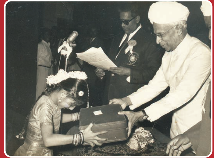
Receiving Prize inter Ministry Dance competition From President - Dr.Sri.Radhakrishnan