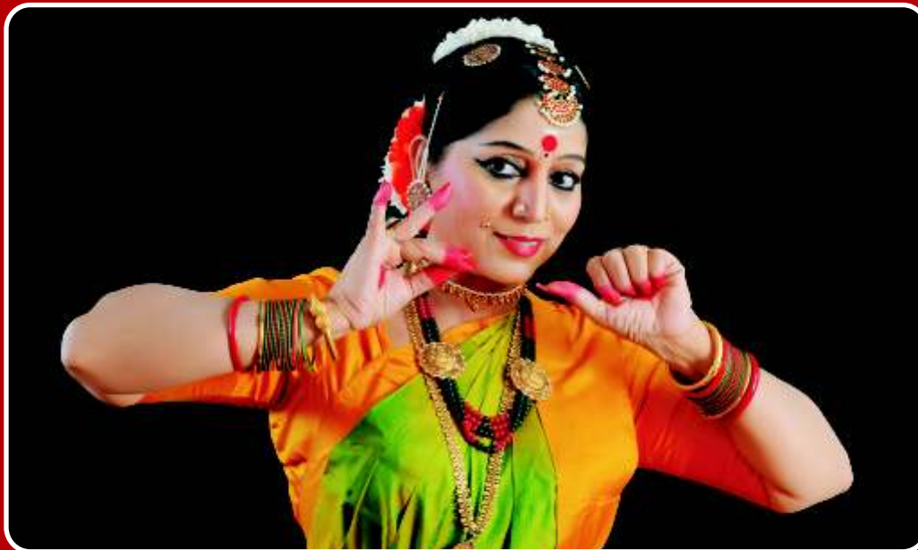
"Debadhara Festival" Delhi (Aug' 2016)