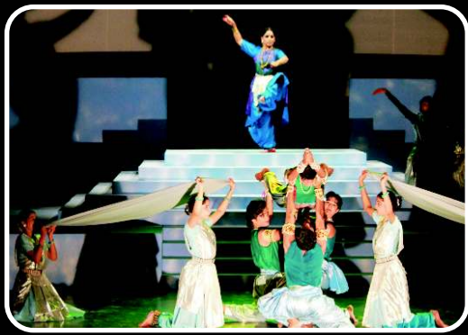
"Antariksha Sanchar" evolution of Flights and Aircraft, Delhi (2012)