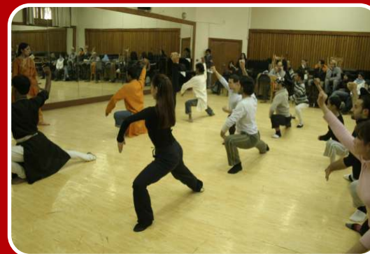
Interaction with the students Department of performing arts Demoscas - Syriya (2007)