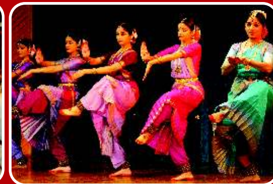
Rasika Ranjini Sabha Trichy (2011)