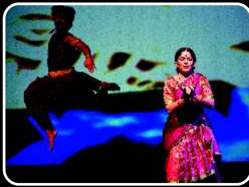
"Awakening", Bangaluru (2010), Delhi (2015)