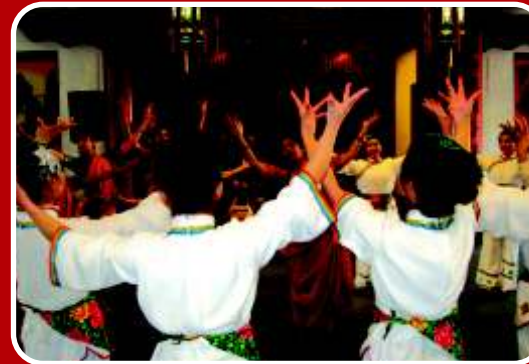
Shanghai - Jan 27, 2013 Workshop & interaction with the Chinese dancers at Changing District Art Centre (2013)