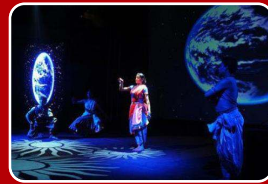
Light, NCPA, Mumbai (2015)